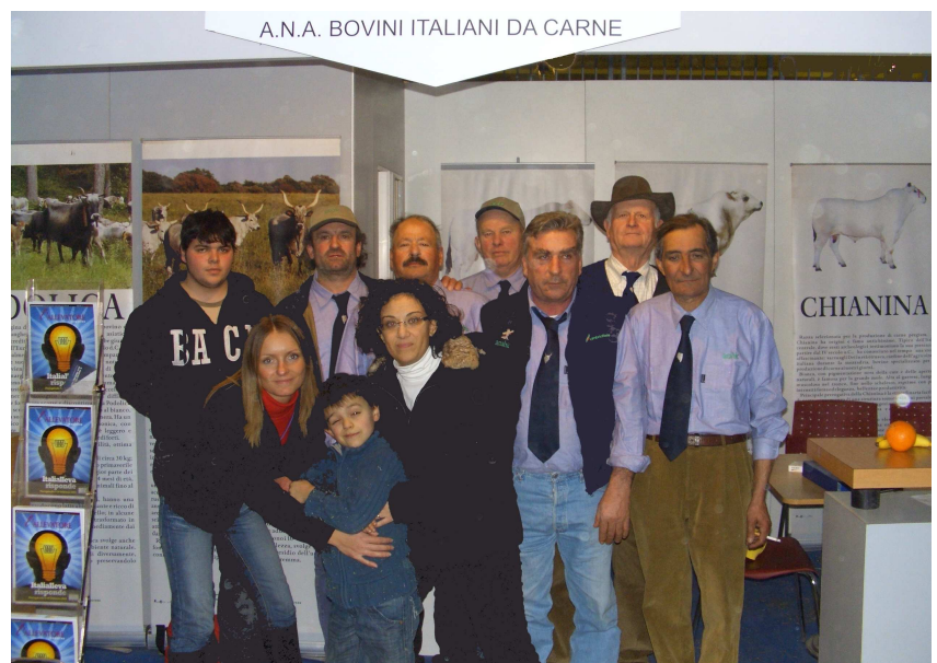
Breeders and ANABIC technicians at Fieragricola 2008

Precisely with regard to the various themes connected with the sector, 120