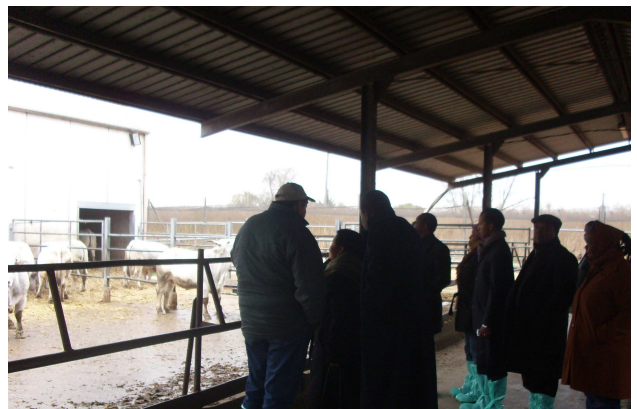
The visit of the South African guest to "La Viola" Romagnola Herd