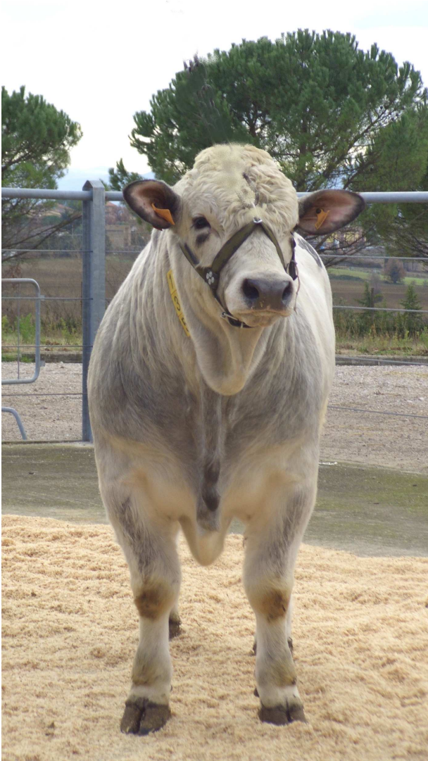
Sarastro delle Querce, one of the highest Romagnola sellers

Nine animals, five approved for A.I. and four for N.S., took turns in the ring and, among these was the Top Price fetcher