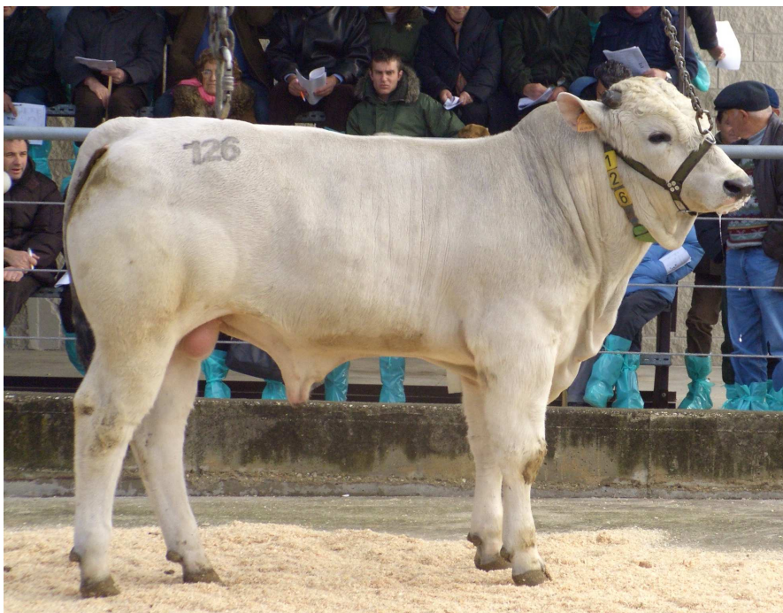
“Saturno della Favorita”, Top Price Chianina bull