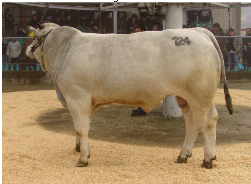
Scudo, by Birbo, Top Price Marchigiana bull

In fact, the majority of the animals expressed themselves best in their trunk length, skeletal correctness, and transverse diameters, characteristics which place it at the top of world beef breed rankings.